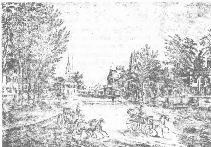
Keene as it appeared during the closing years of the glass industry