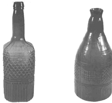
Blown three mo'd decanters, or bottles, in heavy dark glass

wide, 16 feet high and 2½ feet thick, to be laid in lime mortar. The materials to be delivered near the spot, to commence about the first of April next. Also for finding the materials and putting on the roof to said building, or the timber." Before long a large and substantial stone building replaced the earlier wooden structure and bottles of every description found their way to a growing market. Blown three mold glass, America's ingenious inexpensive answer to the fashionable high-priced cut glass, was also manufactured here, the principal commercial items being inkwells and quart and pint decanters. This output continued until the introduction of pressed glass at other factories caught the public fancy and interest in blown three mold ware declined.