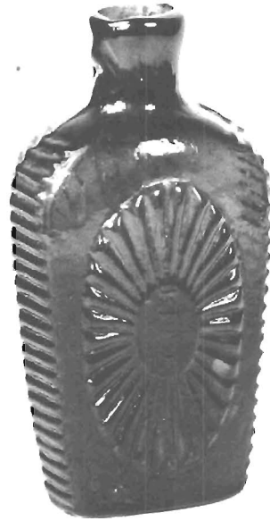
Sunburst—note spelling Keen instead of Keene