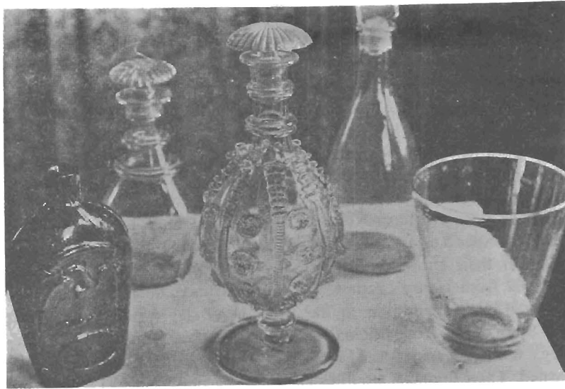
Glassware in front row made by Marlboro Street factory— tumbler & decanter under Schoolcraft in 1816; flask by a later concern; two rear decanters of unknown origin

dians whereby 16,000,000 acres of land were added to the U. S. and authored many works, ranging from an autobiography to A View of the Lead Mines of Missouri . It was he who inspired Longfellow to write Hiawatha and a few years before his death in 1864, he began preparation, under a Congressional appropriation, of an elaborate work entitled Ethnological Researches Respecting the Red Man in America .