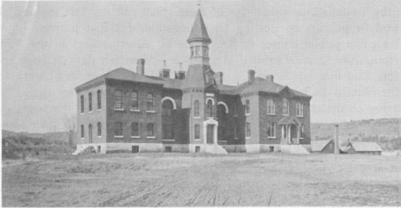
Cheshire County Jail on what is now Fuller Park former location of N. H. Glass Factory

In March, prior to Schoolcraft's engagement as superintendent, a notice appeared in the New Hampshire Sentinel proposing a glass factory "90 feet long, 60 feet wide, and 20 foot posts and 40 foot rafters, to stand about 1/2 mile northeasterly from the meetinghouse