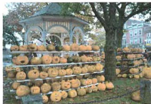
Shaundi Rider photo, 2017