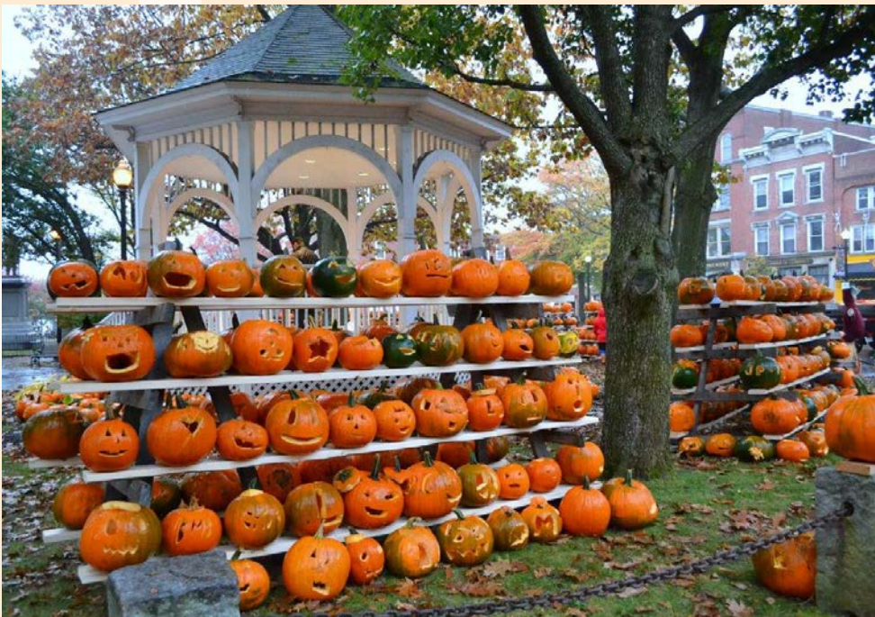
Shaundi Rider photo, 2017

Spirit of collaboration, an example to our community and beyond Attracting volunteers, including several dozen students from Keene State College, puts a spotlight on coming together as a community.